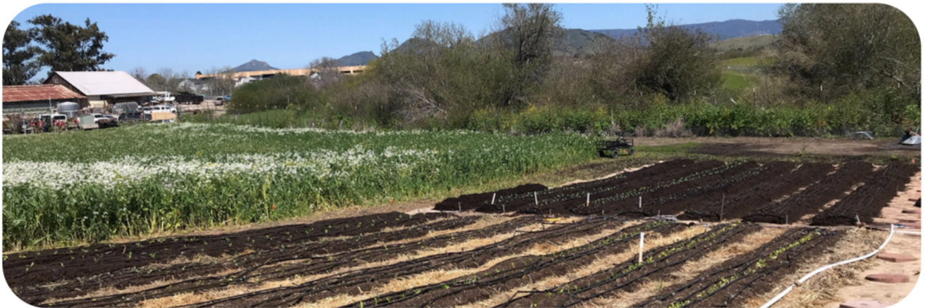
Healthy cover crops and new permanent beds in our main field