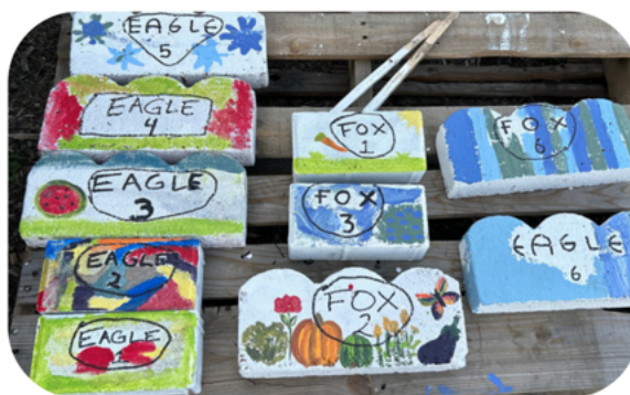
Artsy volunteers paint row markers