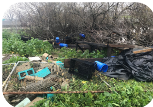
A pile of supplies swept away