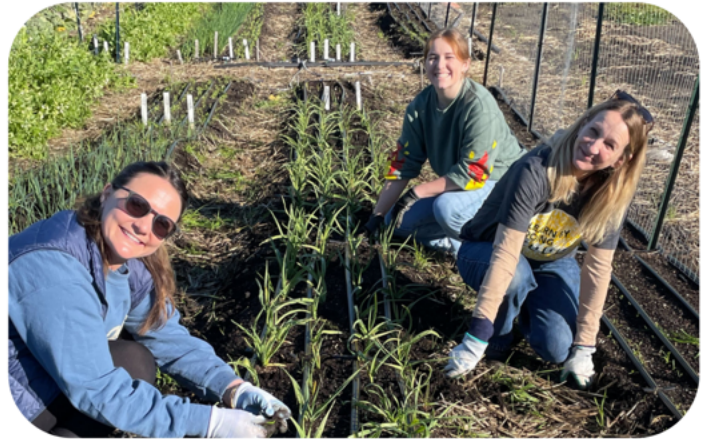
Caring for young garlic plants

New in 2023: year-round farming! In San Luis Obispo, our mild winters and sun-soaked summers are perfect for growing all sorts of good stuff! We've extended our growing season and introduced permanent veggie beds in our main field. All of our produce is still grown using organic permaculture practices.