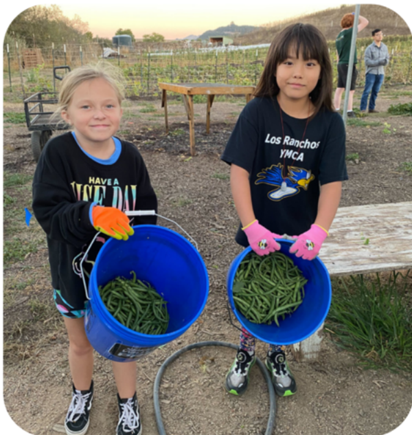
These kiddos are great green bean pickers