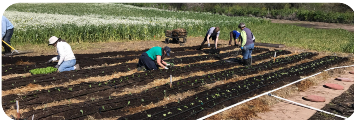
Planting seedlings on a sunny day