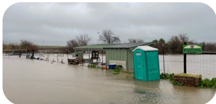
Our parking lot and lower field under 2-3 feet of water