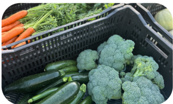
A bit of the summer bounty