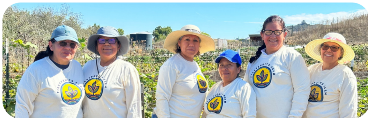
A lovely group of volunteers from Pan American Seed